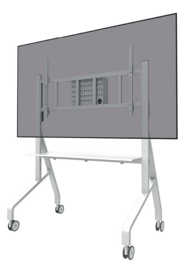
FL50-575WH1 Screen size: 65-110" Capacity: 125 kg Height: 129-139 cm

FL50-575BL1 Screen size: 65-110" Capacity: 125 kg Height: 129-139 cm