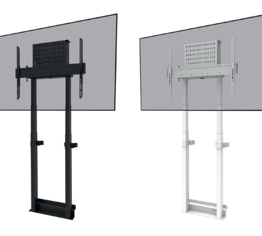
WL55-875BL1 Screen size: 55-100" Capacity: 110 kg Height: 98-163 cm

FL55-875WH1 Screen size: 55-100" Capacity: 110 kg Height: 111,3-176,3 cm